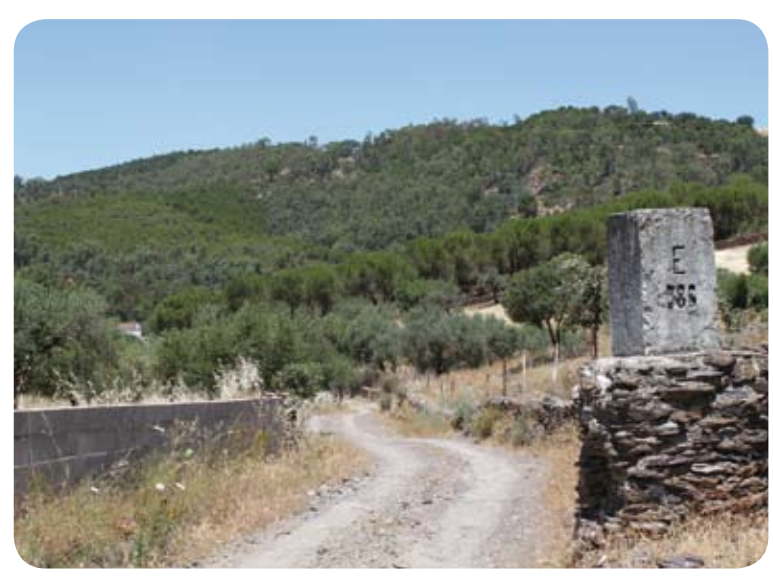
Border between Spain and Portugal

On coming to the bottom off the valley, the path will meet a junction of multiple paths and tracks. We will ignore all paths to the right to take the one that makes a 90° turn to the left and heads towards a pine forest bordering the last plots of Olive grove in Barrancos municipality.