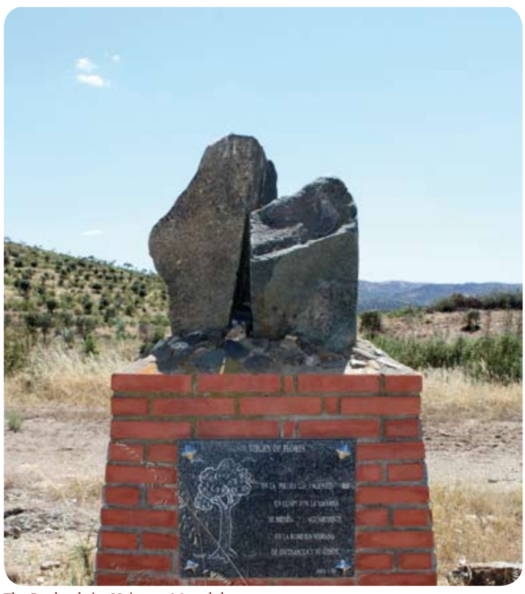
The Piedra de los Valientes Monolith

As the level flatten, the path straights having fewer curves. A monolith known as La Piedra de los Valientes (The Braves' Stone) locates at the side of the path. During the peregrination to the Virgen de las Flores Hermitage a stop made it obligatory for everyone at this site where there is also a commemorative plaque with the following popular reading: