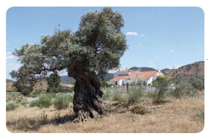
A hundred year old Olive tree near Virgen de las Flores Hermitage

The Virgen de las Flores Hermitage surrounding area is a natural site where every year pilgrims gather in a traditional celebration. News about this hermitage and the natural site can be found in some manuscripts about the way the area was populated after the Spanish Reconquista (reconquest) in the late 13th century. The main pilgrimage takes place eight days after Easter Sunday, on a Monday and on August 15th is held the popular celebration known as the 'Romería de los Emigrantes' (the pilgrimage of the emigrants). The hermitage surrounding area resembles a picnic area well equipped with some picnic tables and benches, water taps and some metal structures to shelter pilgrims from the rain and sun. Nevertheless, what call our attention the most are two old massive Olive trees and the astonishing size of their trunks. Certainly, those hundred years old trees appear to be silent witnesses of the past history.