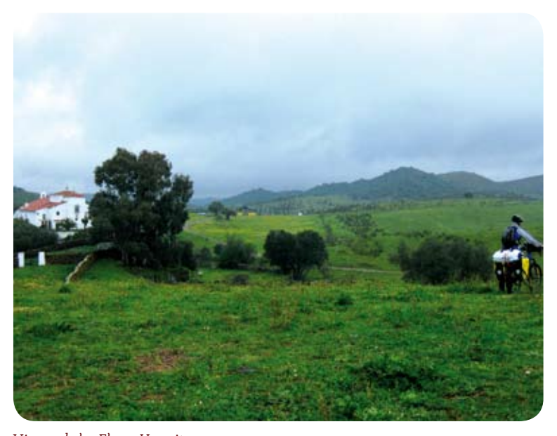
Virgen de las Flores Hermitage

Just after passing by a dairy, another gate is blocking the path that makes a turn to the left to save the watercourse to finally arrive to the Virgen de las Flores Hermitage.