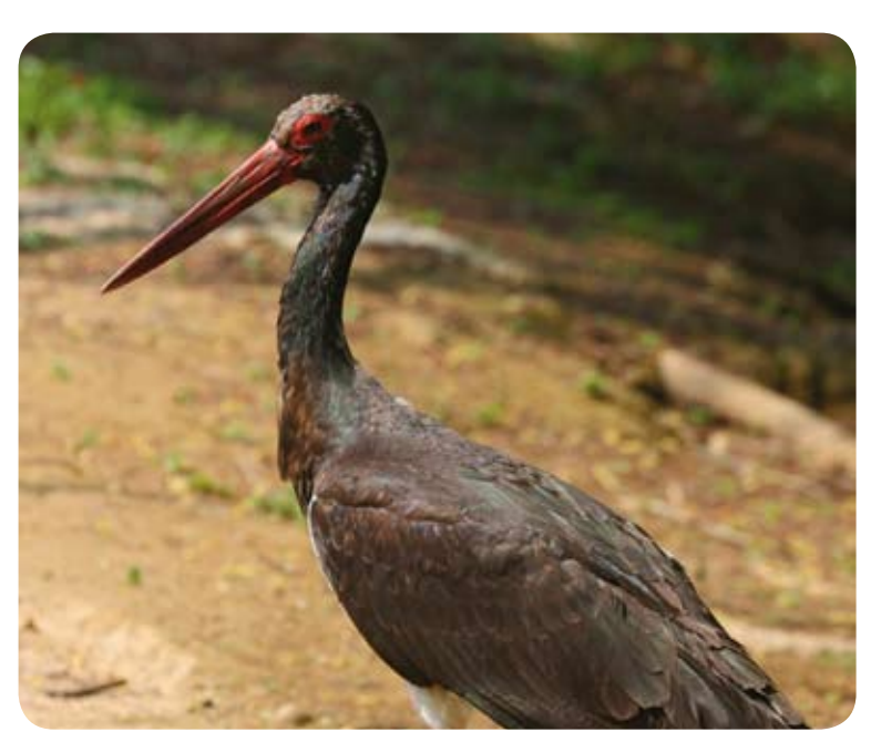
Black Storks are very common at the Múrtigas Riverbanks

On following the road direction, we will meet a fountain on the side of the road. The fountain is from 1959 and has two water-tubes coming out from a showy front to pour water into a central basin (pilar). Nearby there is also a picnic area with some picnic tables. As the path goes through this natural gorge carved by the brook, we will leave behind the Portuguese territory to come into Spain through Huelva province. The road will come to a junction with the road to Aroche town yet we will continue walking straight ahead. The road wades across a small brook and we will take onto a dirt path that branches off to the left and that is blocked by a country gate.