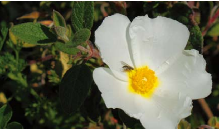
White Rockroses are the ideal food for some species of insects, reptiles and birds

The trail will wade across the brook again to get to the riverbank on the right. From there the trail turns into a dirt path and passes by a group of