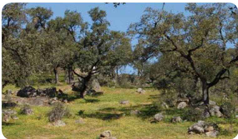
Rocks outcropping at the pastures in the Valle del Muchacho Valley

Pastures of Holm Oaks and Cork Oaks will be our companion until we get to the Valle del Muchacho Valley . Apparently, the name of the valley comes from a terrible incident happening in the area time ago. According to the legend, in times of wolves a young man was on his way back to the village after being working all day up in the mountain. The young man and his donkey were travelling on this same path when a herd of wolves stalked and then attacked them, giving death first to the man's donkey and killing the young man after. We might say that the irreproachable wild instinct of the animals gave name to this beautiful natural site.