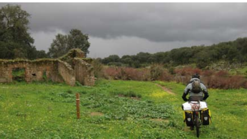
The remains of a former watermill near the Rivera de Cala Natural Site

We can imagine how important this old watermill was in other times just looking at the remains of it. Today, this magnificent building appears to collapse in front of us. However, it is easy to believe that many families were fed in the past thanks to the force of the river waters. The lush vegetation at the healthy riverbanks will change their features according to seasons yet walkers will be always delighted by a rich riverside vegetation comprising Tamujos, Oleanders, Rushes, Brambles,