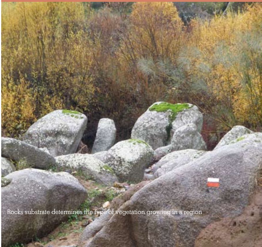
Rocks substrate determines the type of vegetation growing in a region

In this region we will find very old rocks formed in the Precambrian Period and igneous rocks