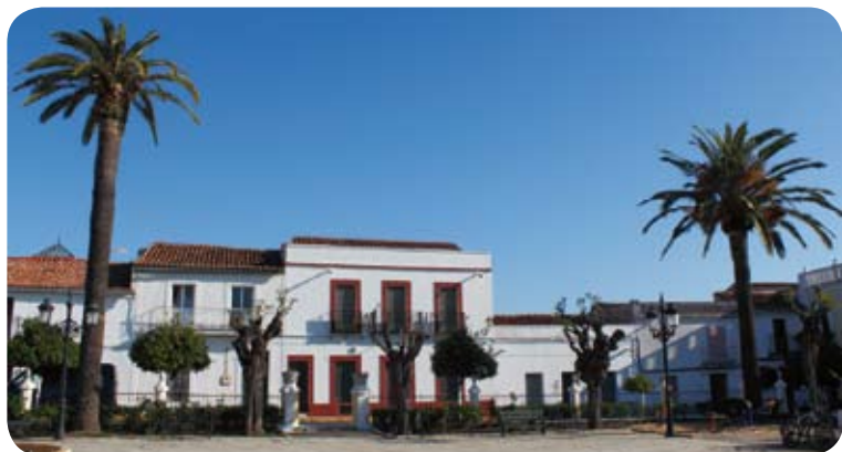
Plaza de la Constitución Square at Santa Olalla del Cala village

This last stage of the GR-48 Trail starts off at the stone bridge located out-