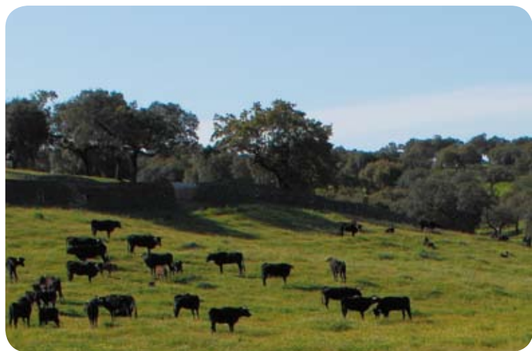
Extensive livestock farming is very common in the region

The trail moves away from the village and follows up the road which soon will be surrounded by the nearby large pastures of Holm Oaks and Cork Oaks. One easily imagines the close relation established between the town and some exceptional natural sites which from centuries have provided for the pantries in the region and other areas. A good example is the Iberian pig farm to the left of the road and near the Casa de Silva farmhouse.