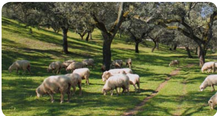
Sheep herds grazing in the pasture

The trail continues ahead and goes across a country fence while passing by and to the right a countryside house with the name of the valley inscribed on the front. The trail continues descending and matches a dirt path that winds under Holm Oaks. We will leave behind and to the left a small farmyard with a nice well curb. The path continues parallel to a seasonal brook known as Barranco Marín Brook which left bank is flanked by the dry stone wall of the farmyard that we have just left behind.