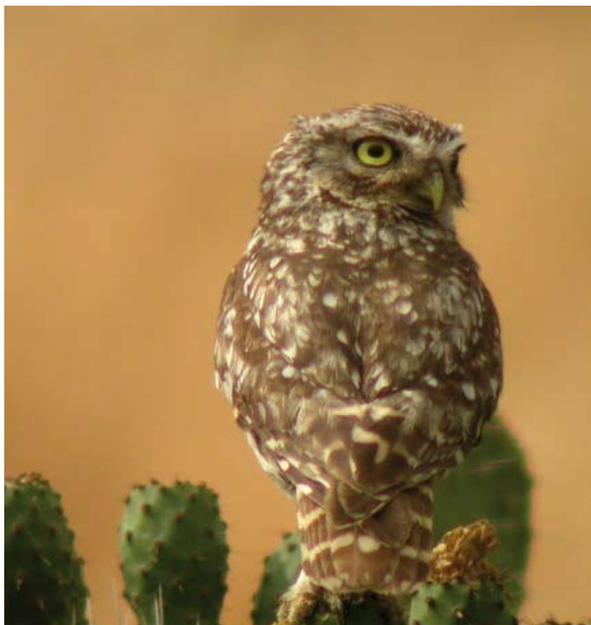
The Little Owl is a common bird at these pastures |

After some 500 metres, the path moves away from the river bank to continue on a countryside road that branches off to the right and that will lead us towards El Real de la Jara village. The trail then matches a section of the Camino de Aguablanca path which slightly climbs up until the outside of the village. From this point we will see some buildings at La Encina Industrial Estate as well as the first houses at Murillo Street . This will be the end of this last stage and therefore of the GR-48 Trail.