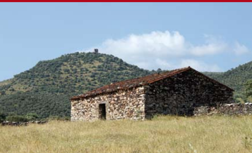
Casas de la Suerte del Montero former country houses and the Castillo del Cuerno Castle in the background