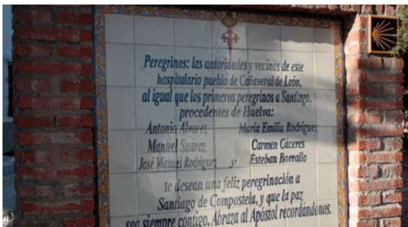
Camino de Santiago Route waymarking sign

to follow up the pilgrimage track. This traditional pilgrimage route matches some sections of the GR-48 route though. In the pasture we will admire a magnificent sample of Holm Oak whose trunk has grown biased.