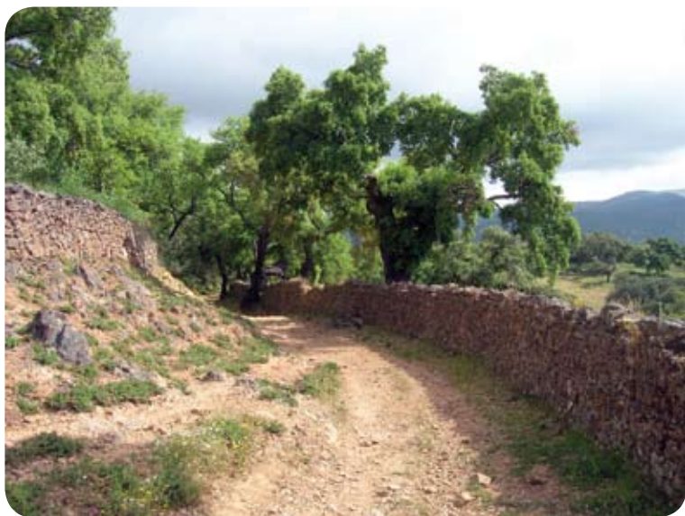
Climbing down towards Arroyomolinos de León

The path starts descending towards Arroyomolinos de León on this last section of the stage. This is a pleasant walk along a paved path which also