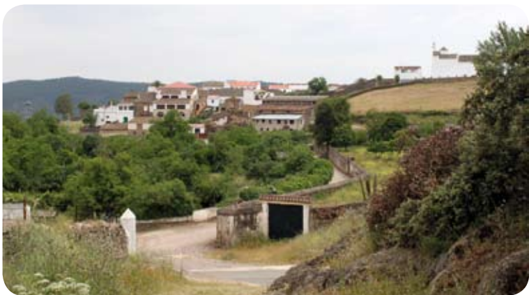
The beginning of the Camino de la Víbora path outside Hinojales village

After the Roman Empire disintegrated, Visigoths ruled by Walia (418 A.D) established some sites in Hinojales surrounding areas. The remains of settlements from the 568 A.D locate in the municipality. From the same year is also a Old Christian tablet which is placed at the altar room of the Nuestra Señora de Tórtola Hermitage. Apparently, the hermitage locates where other cultures of the past used to celebrate their religious ceremonies.